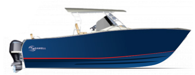
THE UNSTOPPABLE THEME